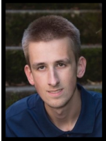
Darryl Strohan Lighting Design