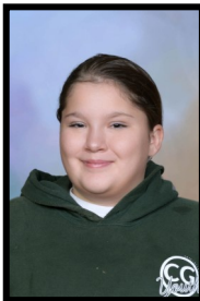
LUCY MAUDE MONTGOMERY